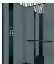
1. D-300 Day, K11 Techno grey 2. D-300 Night, K12 Madagascar Vanilla 3. D-300 Day, K13 Bamboo Green 4. D-300 Night, K14 Polar Silver